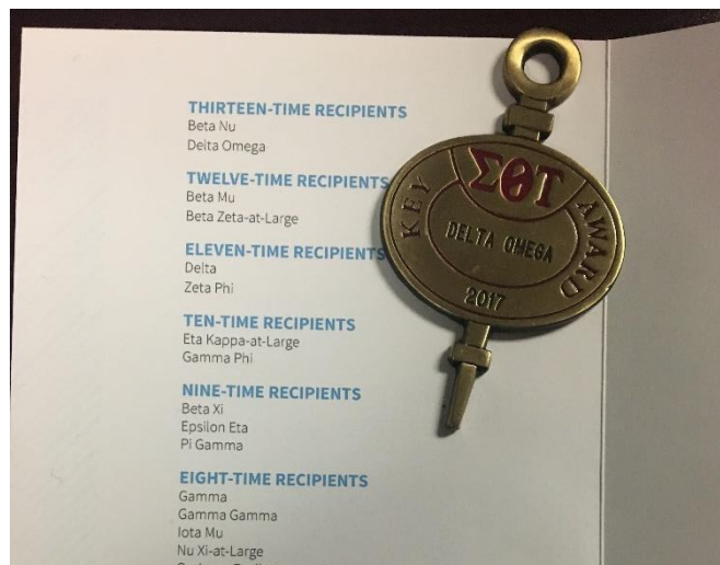
Delta Omega's 13th Key Award